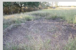
Feral hog rooting damage