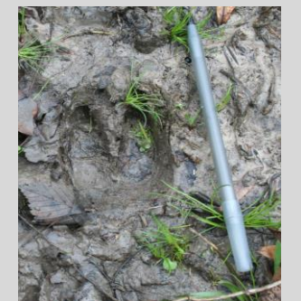
Feral hog track