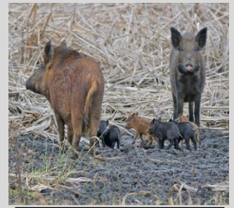
Feral hog sounder