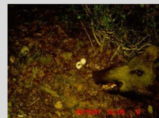
Feral Hog Consuming Rio Grande Wild Turkey Nest