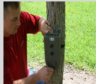
Trail camera installation