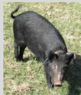
Feral hog fitted with a tracking