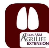
Feral Hog Management App