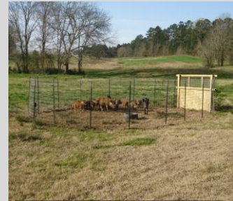
Corral trap with feral hogs