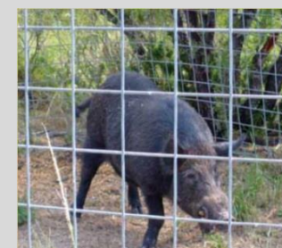
Feral hog in a corral trap